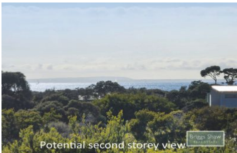
Potential second storey view